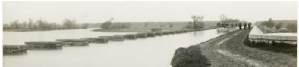
RICHMOND AQUEDUCT

If you have not renewed your 2018 membership, or if you would like to join, please use the form enclosed to send in your dues. THANK YOU!